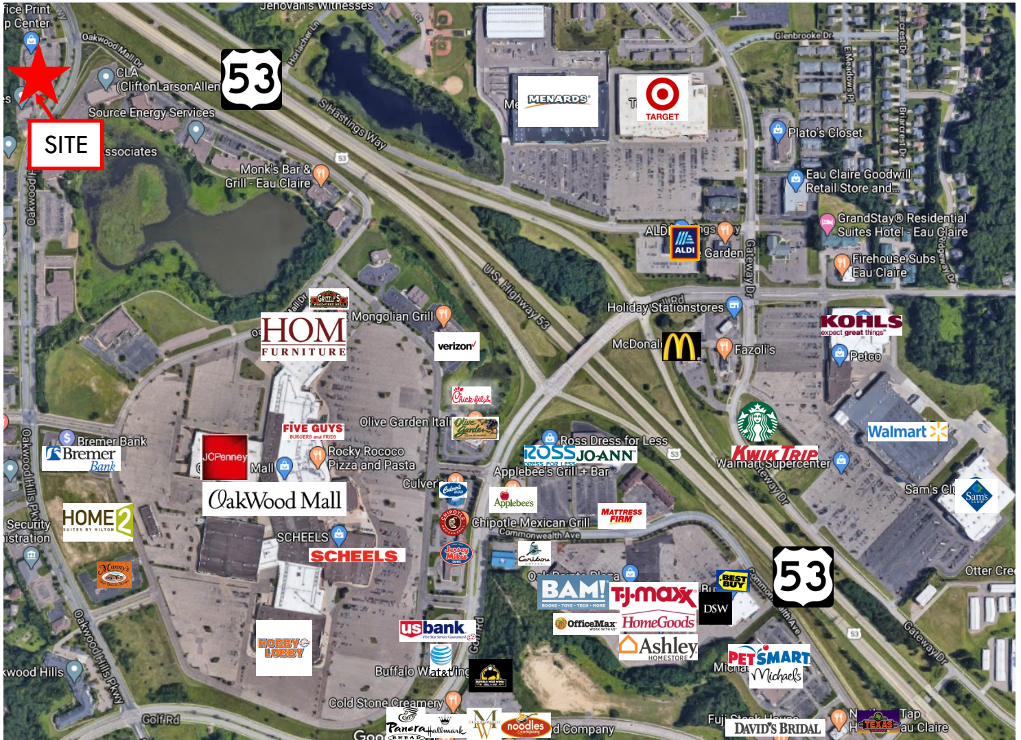
Google Maps, 2020