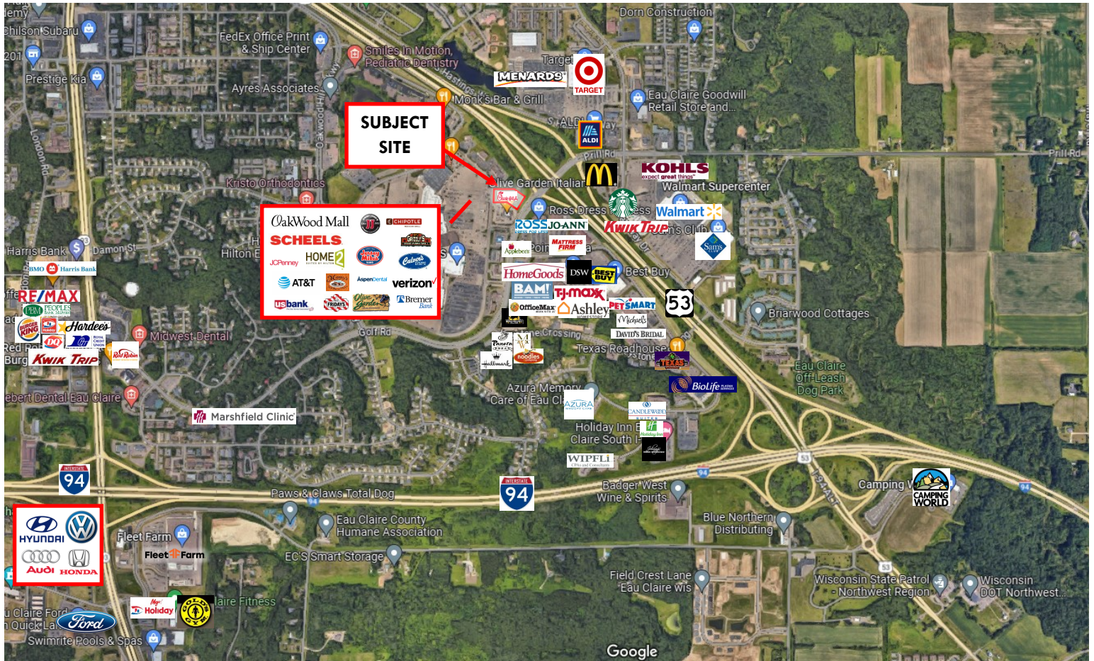
Google Maps, 2023