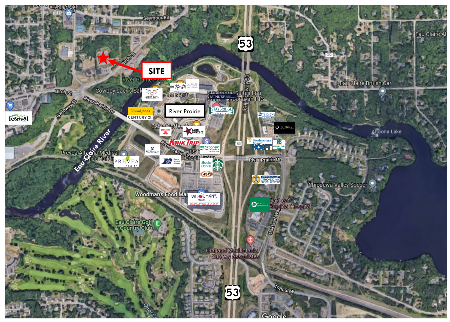
Google Maps, 2023