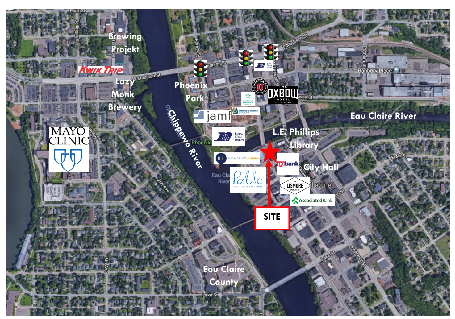
Google Maps, 2024