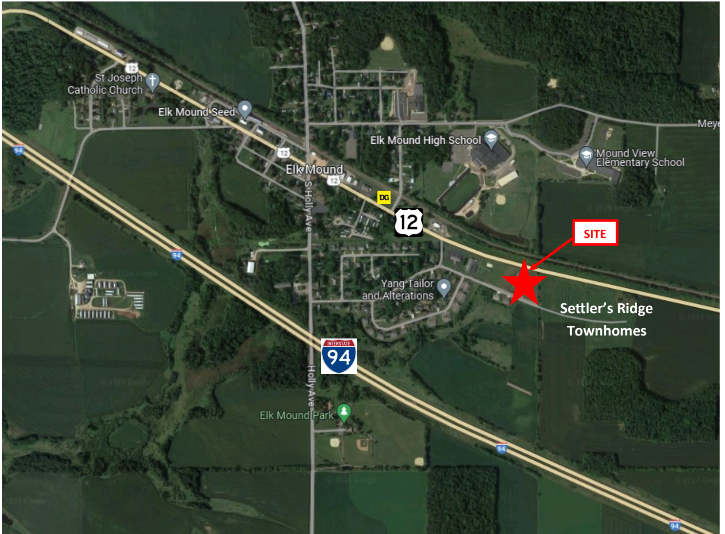
Google Maps, 2024